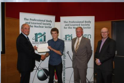
The Judges and winner of the 2014 Student Bursary Competition.