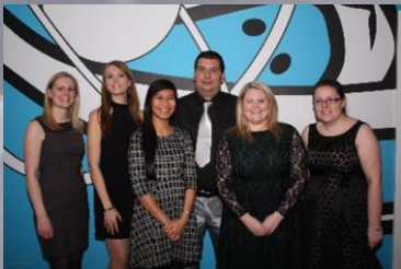
Members of the Cumbria Branch Dinner Organising Team. 2015