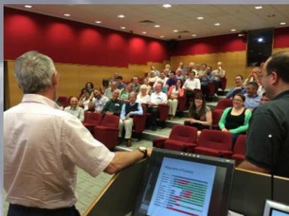
Cumbria Branch members enjoying a talk on the Moorside Reactor Programme from Nu-Gen in 2014.