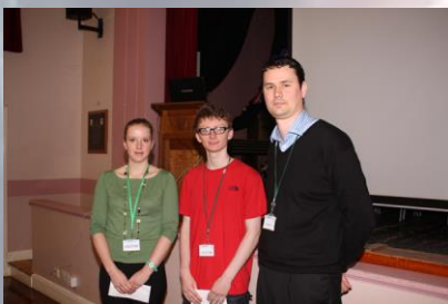
The winners of the 2012 Student Bursary Competition with a Cumbria Branch Member.

Periodically the Nuclear Institute Cumbria Branch is able to organise site technical visits which allow us to share learning and knowledge between the hosting organisation and our visitors. Recent visits have included BAE Systems submarine construction facilities at Barrow-in-Furness.