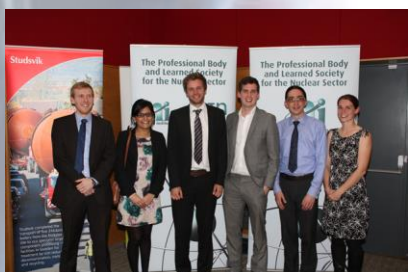
The 2014 entrants to the YGN's Cumbria Young Person Speaking Competition heats.