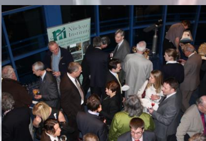
Cumbria Branch members celebrate the launch of the Nuclear Institute in 2009.